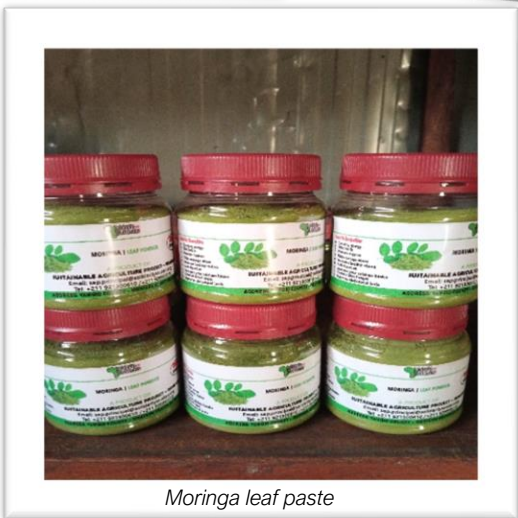
Moringa leaf paste