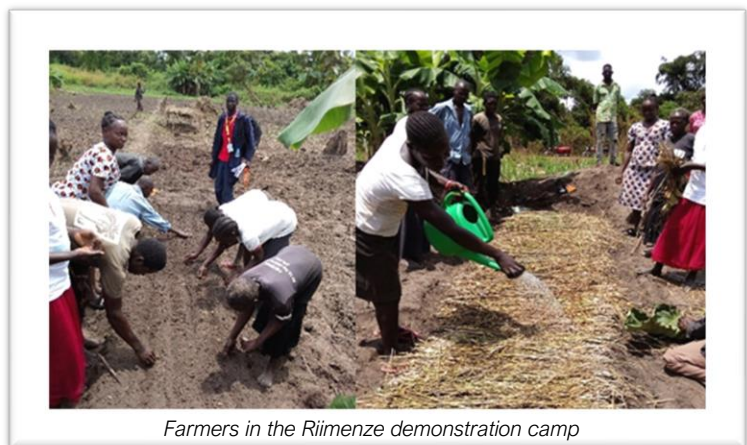
Farmers in the Riimenze demonstration camp