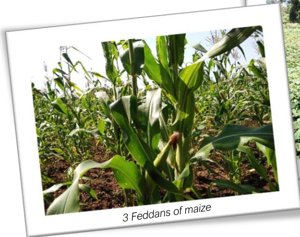
3 Feddans of maize