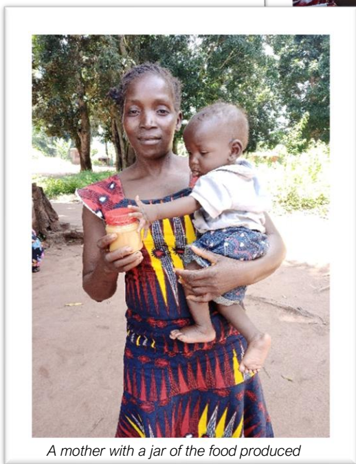
A mother with a jar of the food produced