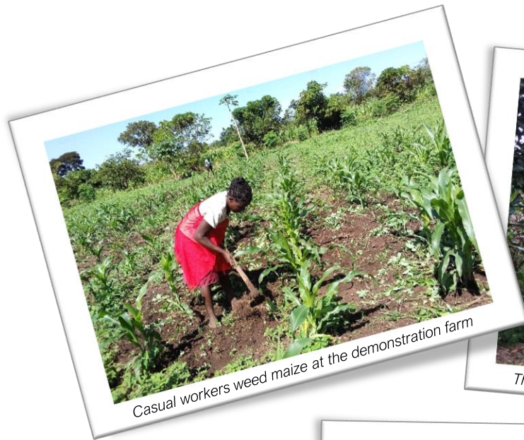
Casual workers weed maize at the demonstration farm