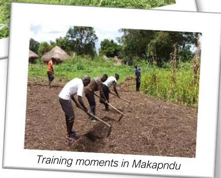
Training moments in Makapndu