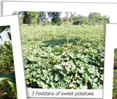
3 Feddans of sweet potatoes