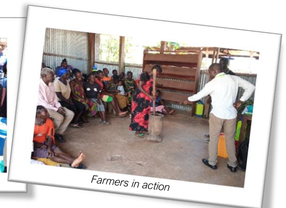
Farmers in action