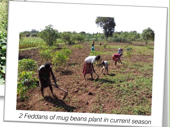
2 Feddans of mug beans plant in current season