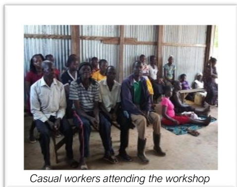
Casual workers attending the workshop