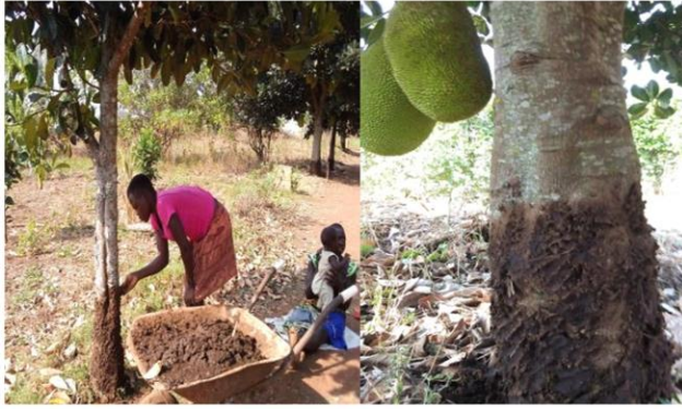
A young girl learns how to smear cow dung on the jackfruit tree

Natural pest prevention Smearing cow dung on the stem of jackfruits is an excellent local method to repel and prevent pests that can damage the fruit!