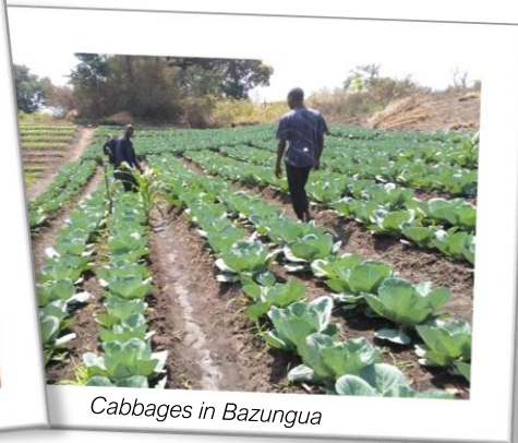
Cabbages in Bazungua