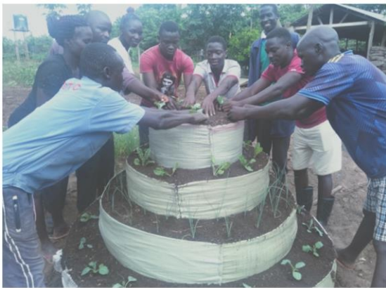
SARDI Students learn the multiple vegetable garden method

Students from the SARDI (Sustainable Agriculture Rural Development Institute in Yambio), who came for their internship in Riimenze, actively participated in the growth of the multiple vegetable garden, which was introduced by the livelihood manager for these students as part of their learning. This is used when there is a shortage of land for the vegetable garden; soil was brought in from somewhere to grow this garden. The vegetables planted here are sukumawiki and onion. The students were very happy to have learnt this method from Solidarity, where they were for their two-month stay, as one of the requirements of their institute