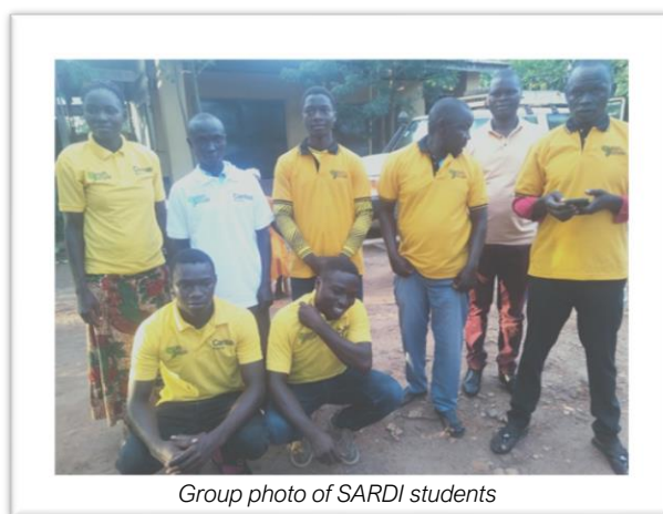
Group photo of SARDI students

The students (4 men and 2 women) completed their internship at Solidarity as part of the sustainable agriculture project, where they stayed for two months and gained more skills and experience in most of the practical agricultural work they had not tackled at their institution. They appreciated the Solidarity management for taking care of them and were very happy to have learnt from Solidarity and said they are now ready to return home and develop their community.