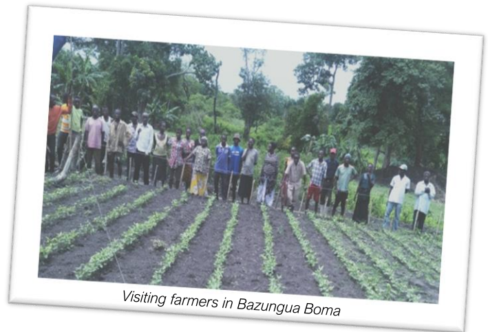
Visiting farmers in Bazungua Boma

Farmers (SAP beneficiaries) from Bazumburu Boma were taken to Bazungua Boma for an exchange visit to learn new farming techniques and methods from other farmers in the area. This exchange visit was very useful for the farmers, who were very happy to see how other farmers practised horticulture in other localities. As a result, some of them became interested in the vegetable garden after seeing the fruits of the Bazungua gardens, which enabled them to pay school fees for their children and more.