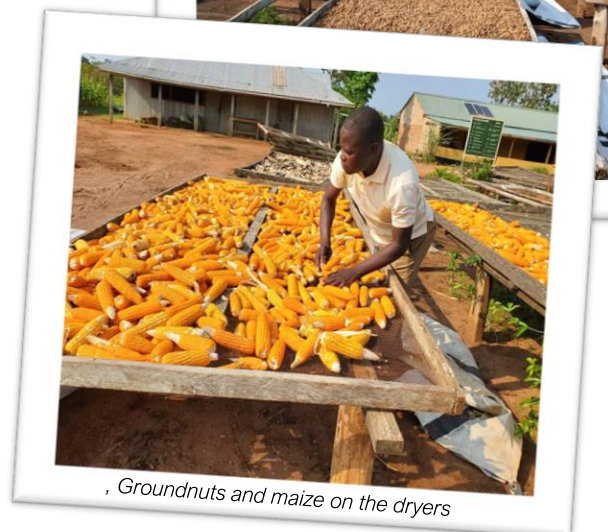
, Groundnuts and maize on the driers