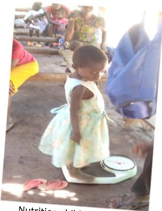
Nutrition child screening