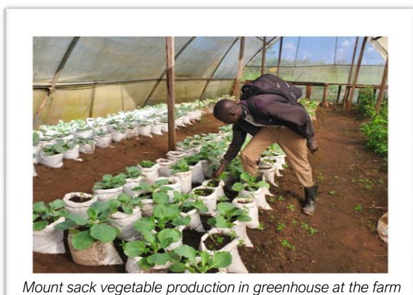
Mount sack vegetable production in greenhouse at the farm