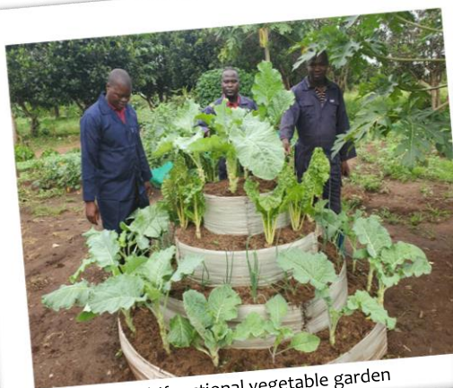
Multifunctional vegetable garden