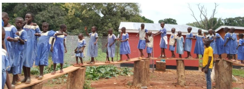
Children walking on the 'Ngu' converted into a teaching aid