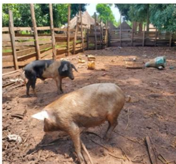
Pig farm in Makpandu