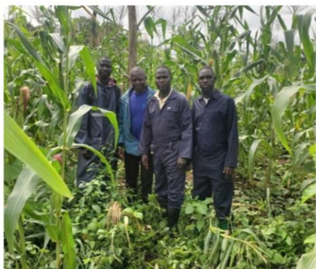
"Monitoring Team" on the field

In these photos, the Project Manager and the Livestock Officer joined the Monitoring and Evaluation officer for monitoring visits to some project locations: Screening Program for Child Malnutrition in Kasia Boma, as well as the livestock farms in Kasia Village and the pig farm in Makpandu. The goal of the visits is to offer supervision that will enhance the quality and productivity of all of the SAP-R activities being conducted in the vicinity, including cultivation, nutrition, and animal husbandry. Among the crops inspected was the multifunctional vegetable garden created for the community at the demonstration farm. This kind of vegetable garden can thrive even when there is very limited space for cultivation. In this method, soil is brought in from the neighboring forest and put into bags into which are placed the seedlings of various vegetables.